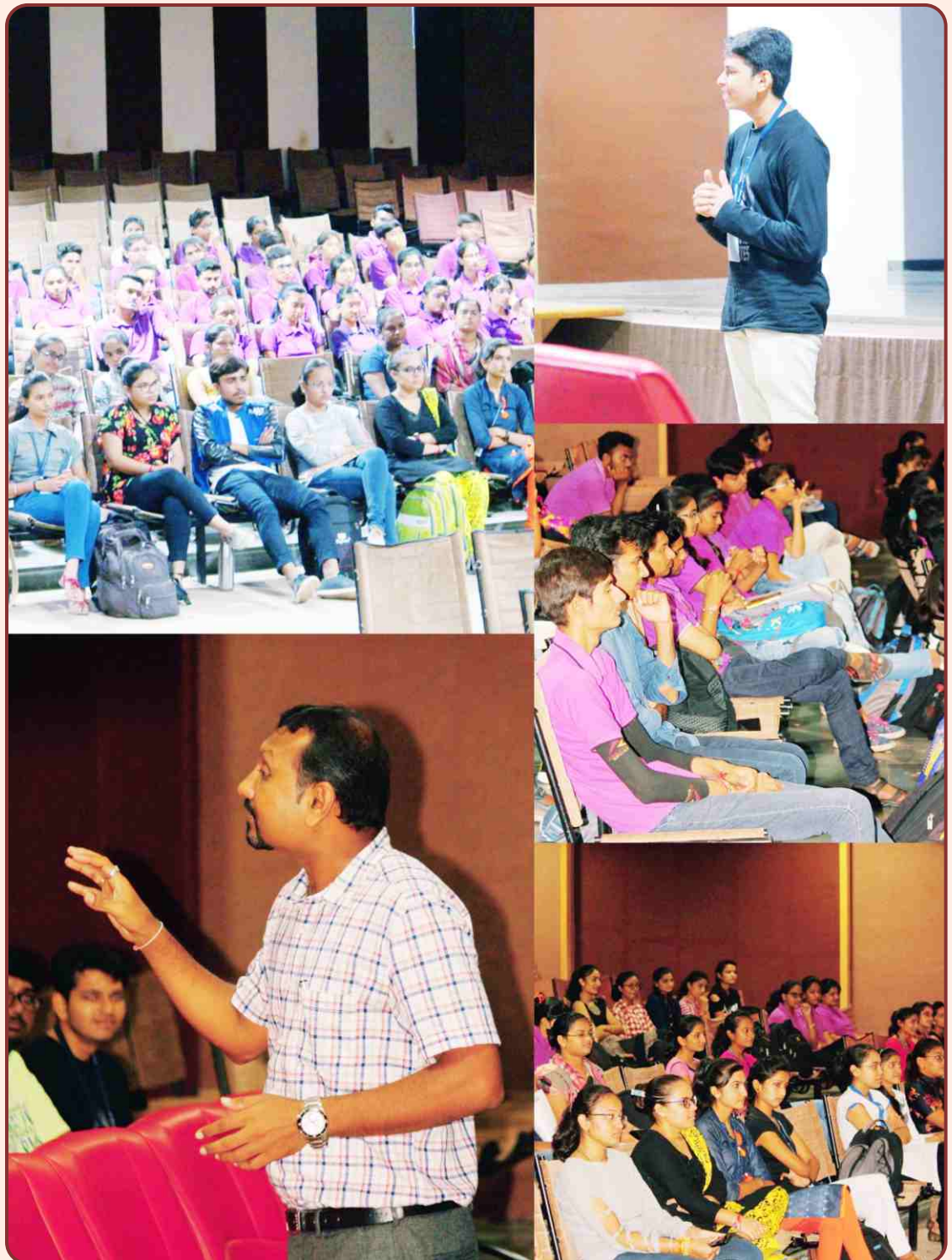
Students Actively Interact With Expert

quick electronic communication of content. Content includes personal information, documents, videos, and photos. Users engage with social media via computer, tablet or smartphone via web-based software, web