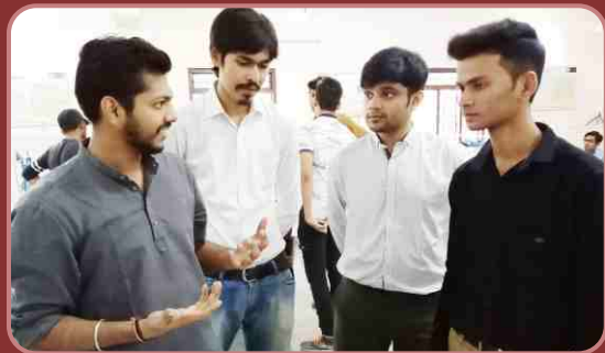
Reviewing Projects by Industry Delegate and Review Panel