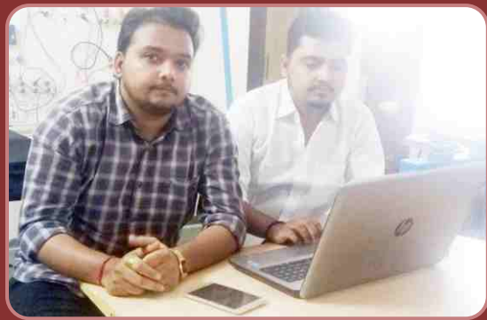
Students Present Their Project