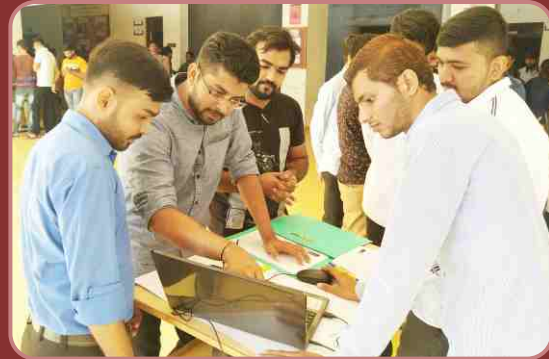
Suggestions Given by Review Panel