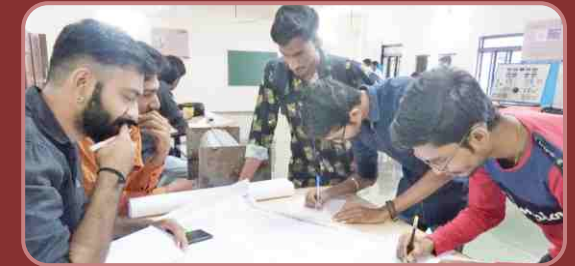
Students Giving Feedback About Projects