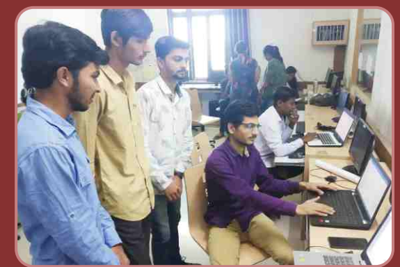
3rd Semester IT Students Visit to Senior Projects