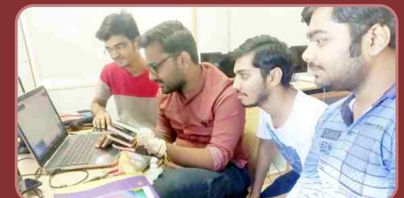
Demonstrating Hardware Project